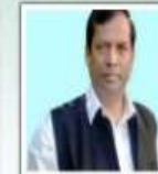
Shri Som Parkash

Minister of State, Commerce and Industry