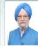
Shri Hardeep Singh Puri

Minister of State, Commerce and Industry