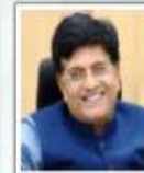
Shri Piyush Goyal