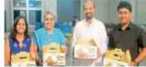
कारंजा : पुणेला येईल विमानाने थेट दुबईला. एसडीएफचे साहाय्य : कारंजातील महाऔरंजमध्ये प्रक्रिया व पैकेजिंग.

विदर्भातील संत्रा विमानाने थेट दुबईला. एसडीएफचे साहाय्य : कारंजातील महाऔरंजमध्ये प्रक्रिया व पैकेजिंग.